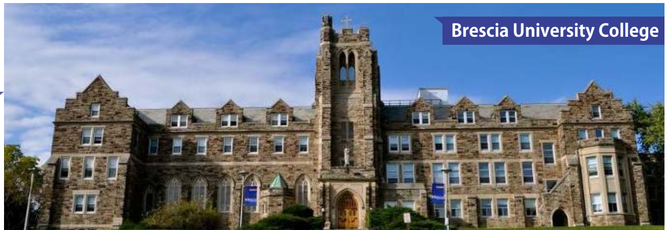
Brescia University College

Brescia University College is a women's liberal arts college affiliated with Western University, and is the only university-level women's college in Canada. It offers a multitude of unique programs including the Department of Food and Nutritional Sciences, and encourages extra-curricular activities and empowerment to help students enhance leadership abilities and growth. All graduates are issued the Bachelor's degree from Western University.