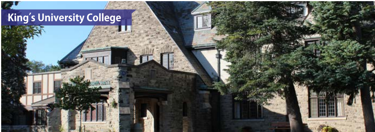
King's University College

Western University is a public research university in London, Ontario, Canada. Founded in 1878, the university operates twelve academic faculties and schools, including Ivey Business School and Western Law. Western has more than 306,000 living alumni worldwide, and consistently places in global rankings. Its education quality and student satisfaction are both ranked No. 1.